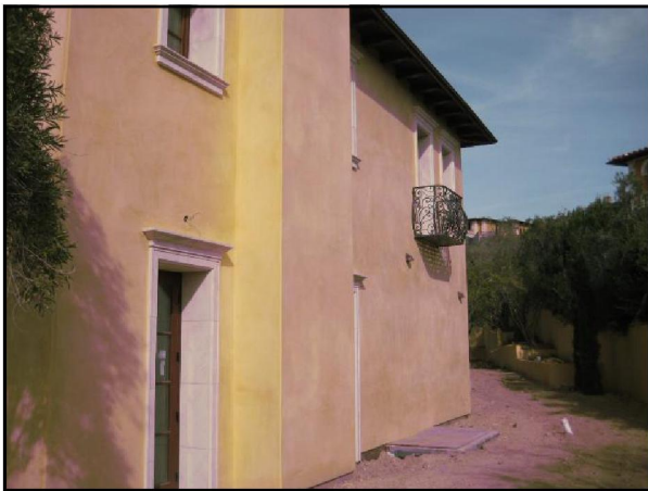
Additional Rear View