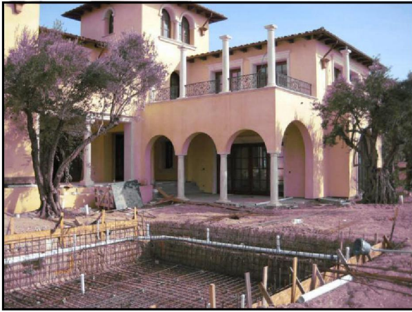
Additional Rear View